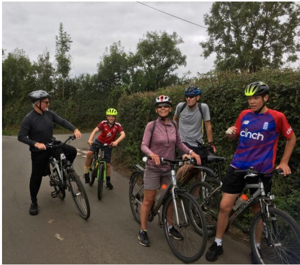
Team Trucker from Buckerell

Here is a sample of Delights on the Day!