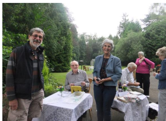
Guests enjoying the Fun and Friendship with Cream Teas, Raffle, Auction and a delightful garden setting.