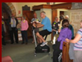
Dolton Church Exercise Bike-In