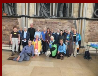
Exeter Prayer Walk