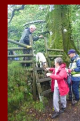
West Dartmoor Benefice

We always enjoy hearing about the activities of our supporters, and appreciate all those who raise funds to enable us to continue giving Grants to our Devon Churches.